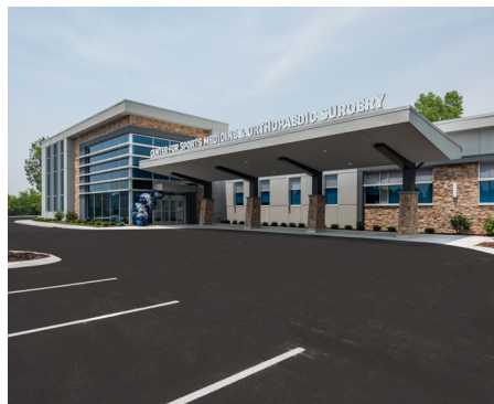
Ambulatory Surgery Center